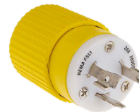
240-277V AC TWIST LOCK PLUG Part# : ****