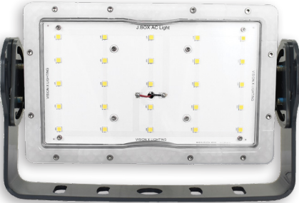
Standard Trunnion Bracket