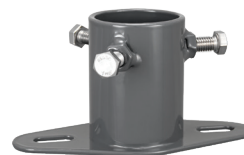
SLIP FITTING Part# : 2" Diameter : LUC-S2 2.5" Diameter : LUC-S2.5 3" Diameter : LUC-S2.5