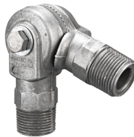
3/4" ADJUSTABLE SWIVEL Part# : ****